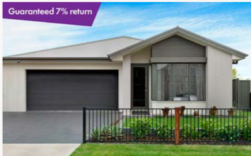
VIBE 21 ▪ Box Hill

Start your savvy investment portfolio with guaranteed returns or live in a stunning specced up home! Sound too good to be true? Well if you don't hurry it might be! Register your interest today.