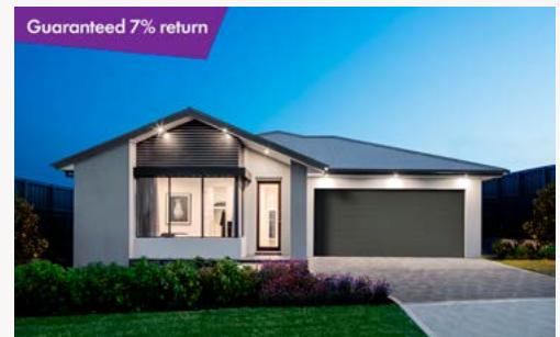
HELIX 24 ▪ Wallis Creek

🛏 4 bedrooms 🚿 2 bathrooms 🚗 2 car spaces 📏 24.7sq