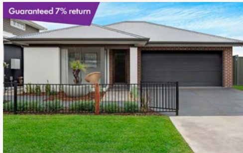
SIENNA 22 ▪ Box Hill

🛏 4 bedrooms 🚿 2 bathrooms 🚗 2 car spaces 📏 21.6sq