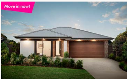
SIENNA 22 ▪ Airds

🛏 5 bedrooms 🚿 3 bathrooms 🚗 2 car spaces 📏 25.0sq