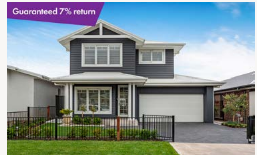
ZEPEL 25 ▪ Box Hill

🛏 3 bedrooms 🚿 2 bathrooms 🚗 2 car spaces 📏 22.1sq